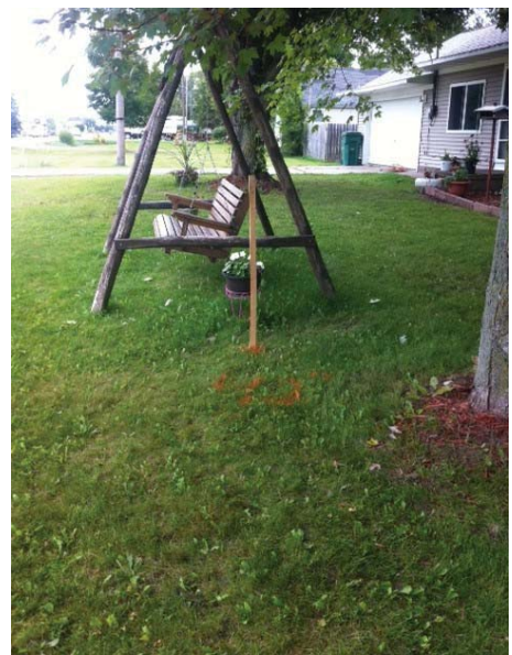
Figure 8: Contractor's Stake in Yard Area Prone to Removal

Once construction proceeded and the contractor began placement of the stakes, the surveyor met again on site with the contractor to review the contractor's markings to ensure stakes were placed at the appropriate locations. The contractor attempted to place PVC tubes over the exposed utility at tie-in and bore pit locations, then backfill around those tubes similar to what Consumers Energy had done on the M-21 project. Once on site, the surveying consultant noticed that the PVC tubes had filled with water and sand had seeped in preventing the utility from being visible. In addition some of the stakes that had been set by the contractor were in mowed yard areas and home owners had removed a few (Figure 8). Since some of these staked locations were removed, the surveying consultant had to delay dispatching the survey crew so the contractor could first place the fiber in the duct. Once the fiber was placed in the duct the contractor toned the fiber location and depth at the areas where stakes were missing. Toning was completed with standard electromagnetic locating equipment. This was the only viable method of re-locating the newly-installed utility where the stakes were removed, short of vacuum excavating the utility at those locations.