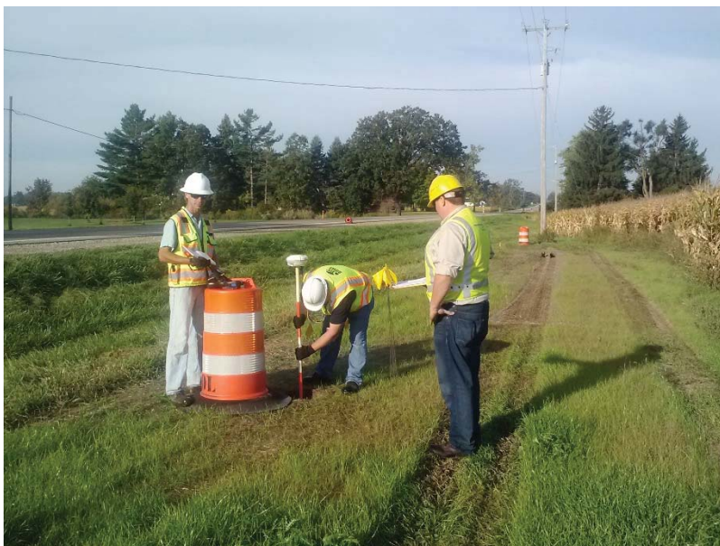
Figure 5: Survey Crew Obtaining Positional Data on Exposed Utility

There were a few noted limitations. Since the utility was completely installed, it had to be located with locating technology before vacuum excavation could begin. There is a potential concern that critical alignment changes could be missed, since the utility was exposed at the required interval per the GUIDE requirements, and not necessarily at every change in horizontal or vertical geometry. This was less of a concern for Consumers Energy, since their installation practices involved tracking all fittings during installation. This is the same general concern shared with HDD techniques. It is recognized that with either technique, there are many variables affecting the final location of the utility and without visual confirmation of horizontal and vertical geometry changes, the potential exists for greater deviations than is desirable between the survey observations.