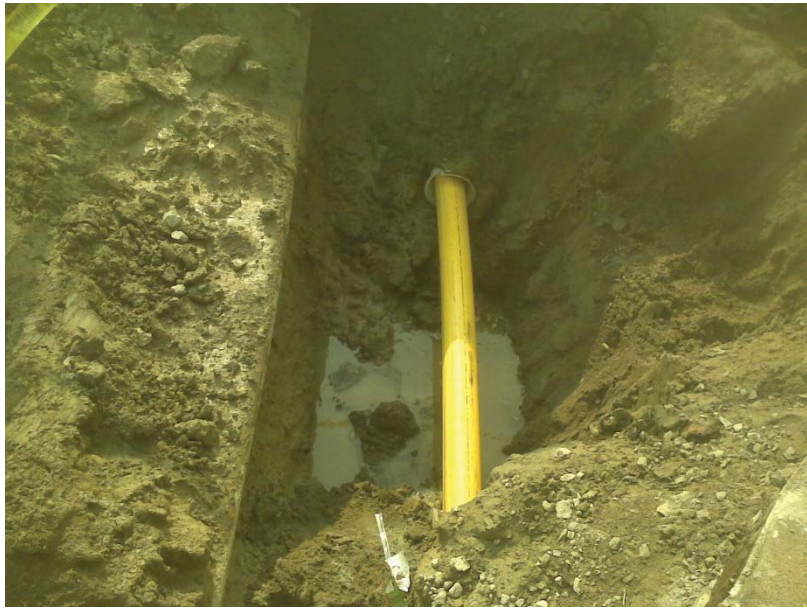
Figure 10: 4" MDP Gas Main Inserted into Existing 6" Cast Iron Main

This project was very unique and interesting as it involved the installation of 15,629 feet of 3" and 4" medium-density plastic gas mains that were to be inserted into existing 6" cast iron gas mains. (Figure 10) New mains were being installed on both sides of Grand River Avenue, therefore the length of new main being installed for this project was approximately 30,000 feet. Ninety percent of the project was completed by the insertion method with approximately ten percent of the installation being completed by HDD and open cut installation where insertion was not feasible. Data collection efforts for this project spanned