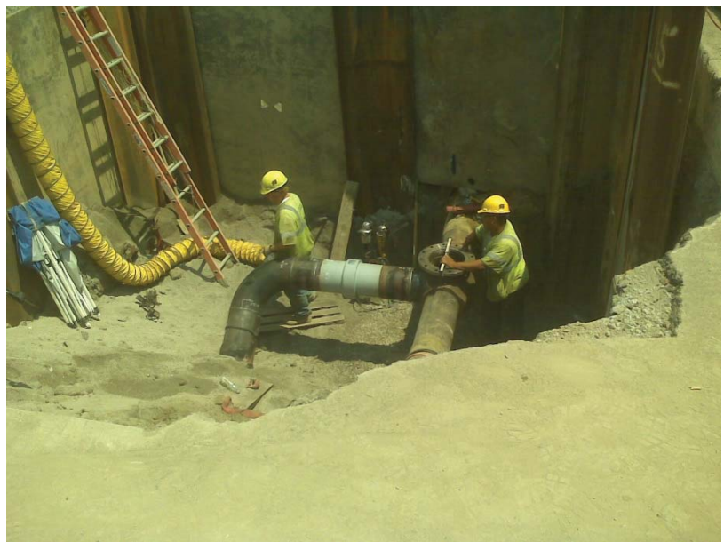
Figure 9: 12" High Pressure Gas Main in Open Excavation

This project consisted of 100 feet of a 12" high-pressure gas main installation by jack and bore method in the Fort Street (M-85) right-of-way at Gibraltar Road in the City of Brownstown, Wayne County. Due to a proposed culvert crossing on Gibraltar Road on the west side of Fort Street, DTE was required to lower an existing 12" high-pressure gas main. DTE coordinated data acquisition activities directly with the contractor on site while the main was exposed. Due to the depth of installation, and steel sheeting used as shoring around the open excavation, GPS was not an ideal tool for acquiring the direct observations on the gas main (Figure 9). DTE's surveyors quickly recognized this and established control points near the excavation. Survey control point coordinates were established by static GPS observations through single 20 minute static GPS sessions. Data for those control points were submitted to OPUS (National Geodetic Survey's Online Positioning User