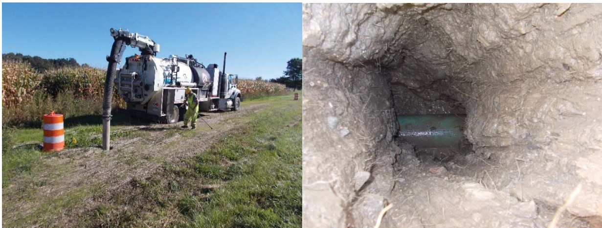
Figure 4: Vacuum Excavation Truck (left) and Gas Main (Right) Exposed through Vacuum Excavation

For this project, Consumers Energy elected to build the entire project as they normally would. Construction crews had no knowledge of GUIDE and made no attempt to coordinate surveying activities during construction. Upon completion of the project, Consumers Energy contracted a vacuum excavation contractor to expose the newly installed utility. With direction from Consumers Energy staff, the contractor first located the utility on the surface at the required locations using electromagnetic locating equipment. The contractor then vacuum excavated the gas main at the required locations (Figure 4). This activity took about 3 days for the vacuum excavation crew to expose the utility at the proper locations.