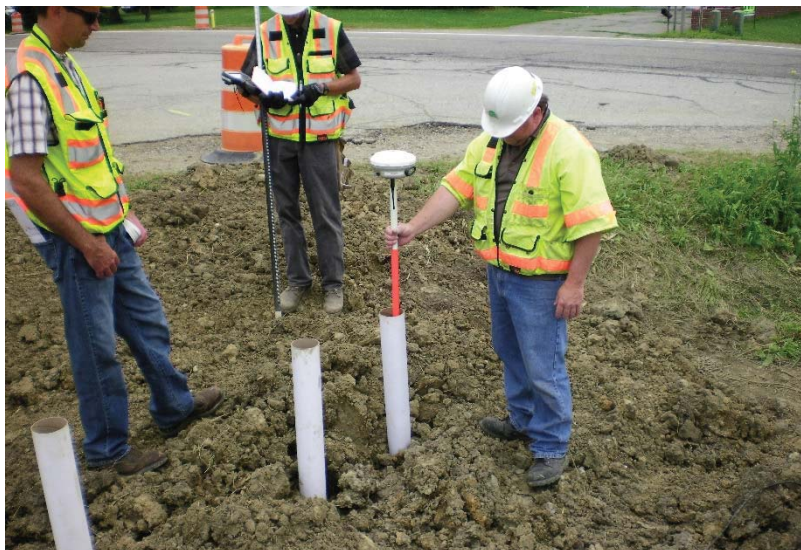
Figure 3: Surveying Utility inside Cardboard Tube

This project also consisted of areas where the gas main was installed by HDD. For those areas, the drill crew was marking the pipe centerline location above the bore head with wood stakes, and marked on the edge of pavement the depth reading from the ground as indicated from the HDD drill head.