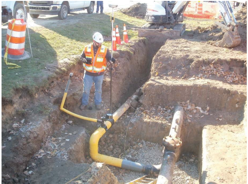
Figure 6: Surveyor Recording a GPS Observation on Gas Main in Open Cut Section

This project went exceptionally well with all critical horizontal and vertical changes in pipe direction being documented during installation and at the required intervals. This project required the daily communication between the surveyor and contractor to coordinate efforts based on construction progress. This was accomplished by committed team members from both the utility and surveying consultant. This project followed the intent of GUIDE, and has likely captured the most complete dataset without missing any critical fittings, tie-in locations or horizontal and vertical changes. This project did require additional time from the construction crew to coordinate backfilling efforts with the surveyor.