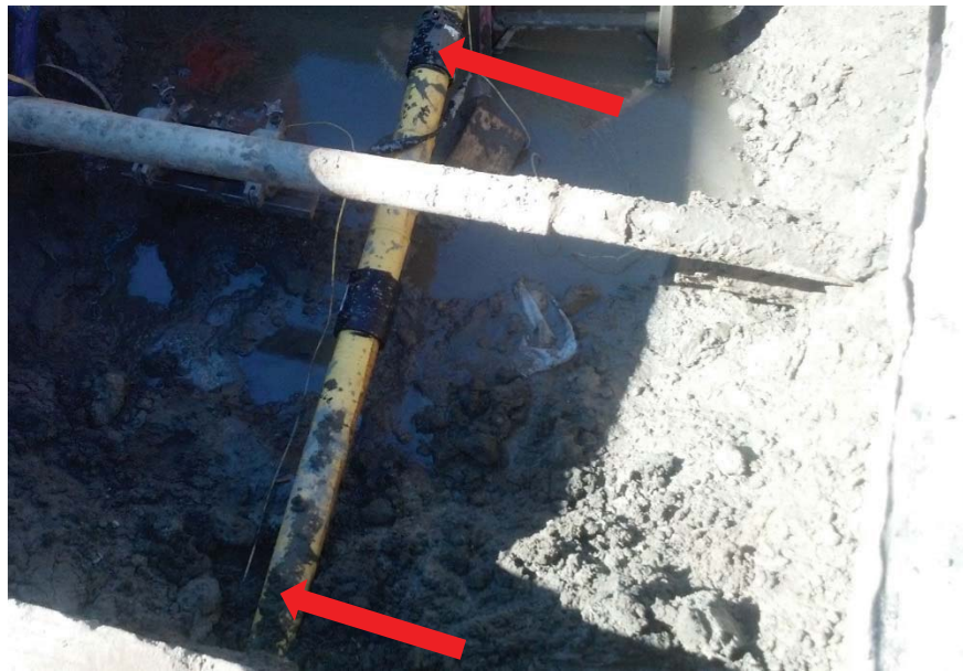
Figure 11: Installation Pit for Insertion Method. Survey Observation Locations Identified

approximately 5 months from early June 2014 to the GUIDE Pilot cutoff of November 10, 2014. This was a large project and provided great insight into the level of effort required to acquire accurate geospatial data in an ongoing effort over several months for larger and more complex projects. Since this project consisted of installation methods other than HDD, data collection efforts had to be coordinated closely with construction activities.