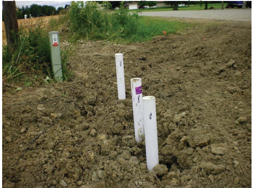
Figure 2: Cardboard Tubes Placed over Gas Main

For the open cut portions of this project, Consumers Energy identified an innovative idea to help mitigate some of the anticipated challenges with having survey crews coordinating with contractors to locate utilities. In addition this project was partially underway by the time internal Consumers Energy staff were prepared enough to begin the data acquisition component. As a result, Consumers Energy staff came up with the idea of having the contractor place a 4" diameter cardboard tube over the newly-installed gas main in the areas where the main was open cut (Figure 2). This technique allowed the construction crew to backfill and continue working without having to worry about leaving the utility exposed while waiting for a survey crew to arrive, or having to coordinate with the survey crew at the time of installation.