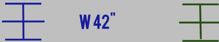
Markings for facilities 12" and larger